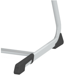
Floor protectors with integrated step protection