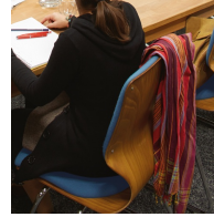
Particularly high backrest increases seating comfort