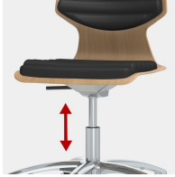
Height adjustment by safety gas spring