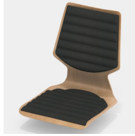
Optionally with seat and back wave upholstery