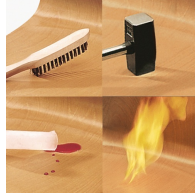
Indestructible PAGHOLZ® shell, scratch, break and impact resistant; flame retardant