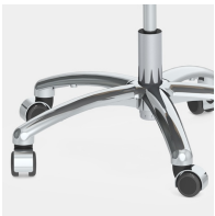
Extremely robust aluminum base