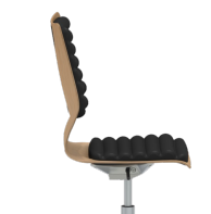
Seat tilt mechanism with weight adjustment