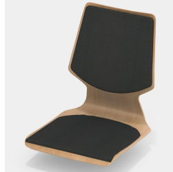
Optionally with seat and back flat upholstery