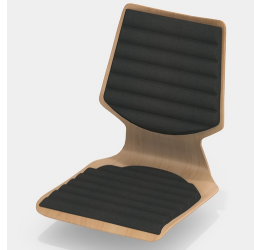
Optionally with seat and back wave upholstery