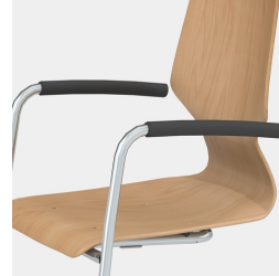
Including armrest with black softgrip cover