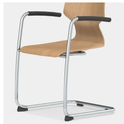
Robust cantilever frame with armrest