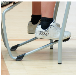
Robust C-shape frame with A2S FLOORSAFE® floor protectors