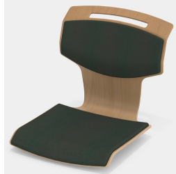
Optionally with seat and backrest upholstery