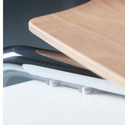
Plate and edge protectors protect the table when it is upended