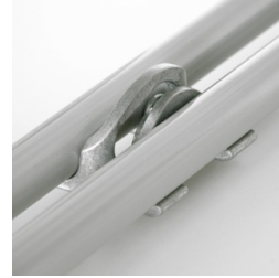
Optionally with row connection from size 5