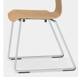
Slender, stable sled frame