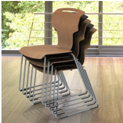
Stackable up to 7 chairs (without upholstery)