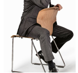
Shell design allows different seating positions, even reverse