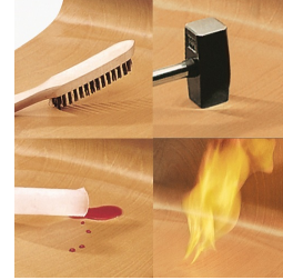
Indestructible PAGHOLZ® shell, scratch, break and impact resistant; flame retardant