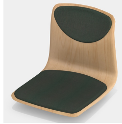
Optionally with seat and backrest upholstery (only sizes 6E, 7)