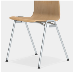
Robust 4-leg frame