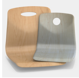
Optionally with grip hole, round or oval (not with backrest upholstery)