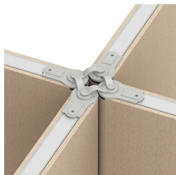
Up to four walls can be linked in one point