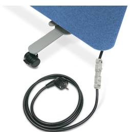
Optionally with electrical set