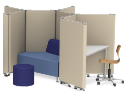
Flexible zoning of the room