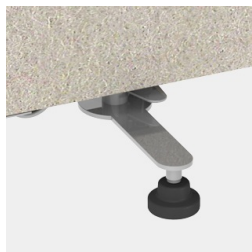
Rotatable base with plastic feet