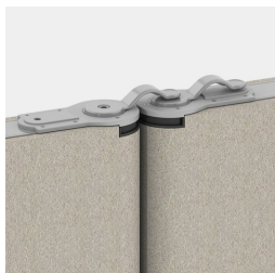
Patented connecting element for linking without tools