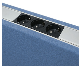
Optional electrical set with 3- way grounded socket outlet