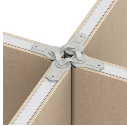
Up to four walls can be linked in one point