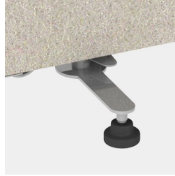
Rotatable base with plastic feet