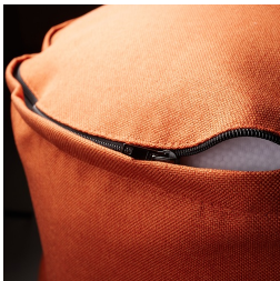
Cover removable by zipper