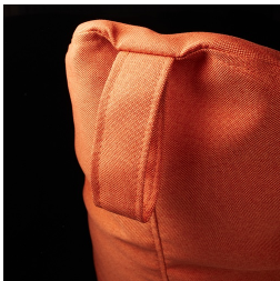
With handle for easy carrying