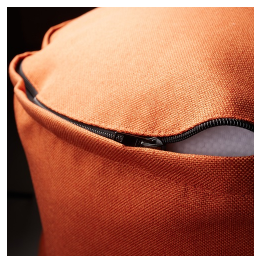
Cover removable by zipper