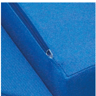
Cover removable by zipper