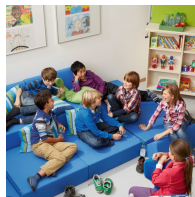
Versatile use due to fold-out function