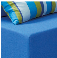
Maximum comfort due to foam core and rounded corners