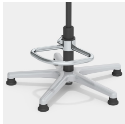
Optionally with partial foot ring