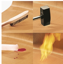
Indestructible PAGHOLZ® shell, scratch, break and impact resistant; flame retardant