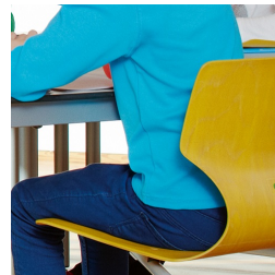
Ergonomically and orthopedically adapted shell shape