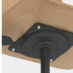
Height adjustment by safety gas spring