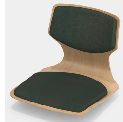
Optionally with seat and backrest upholstery (only sizes 6E, 7)