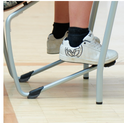
Robust C-shape frame with A2S FLOORSAFE® floor protectors