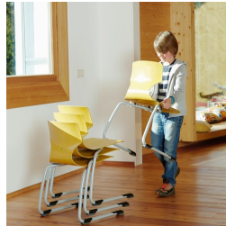
Stackable up to 5 chairs (without upholstery)