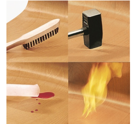
Indestructible PAGHOLZ® shell, scratch, break and impact resistant; flame retardant