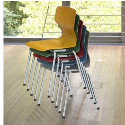
Stackable up to 8 chairs (without upholstery)