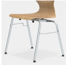
Robust 4-leg frame