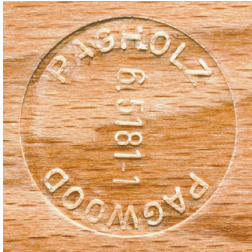
PAGHOLZ® from sustainable forestry