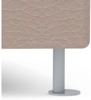
Sturdy round tube frame optionally chrome-plated