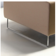
Stable sled frame optionally chrome-plated