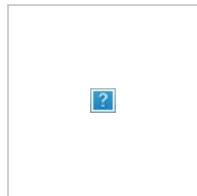
Optional mit geschraubter oder geklebter Bodenbefestigung