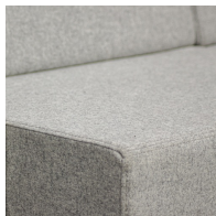
Durable due to high quality workmanship