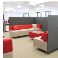
Individually extendable through interlinkable elements