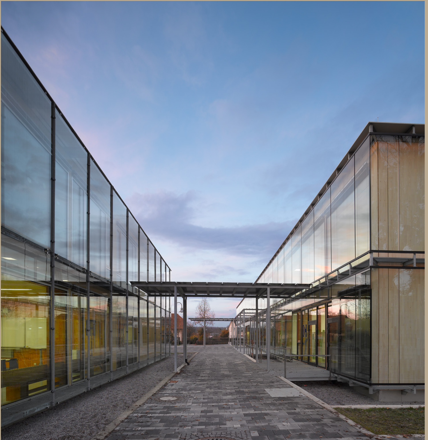
STEISSLINGEN COMMUNITY SCHOOL